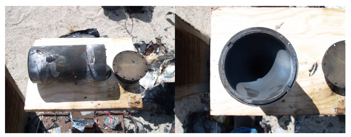
Figure 6. Photographs of the Shaped Charge After the Cook-off Test (No damage to the liner or body was evident)