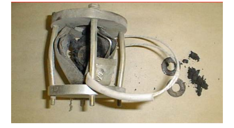
Table 2. Summary of VCCT Testing of DLE-C038