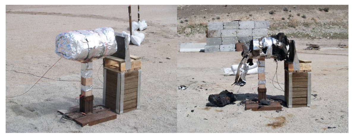
Figure 5. Pre- and Post-Test Pictures of the Slow Cook-off Oven

When these results are compared with testing performed by Collignon<sup>1</sup> using PBXN-110 in the same hardware, a burning response was also obtained. The reaction temperature of PBXN-110 in this test was approximately 17 °C higher than that of DLE-C038, which is to be expected because HMX is more thermally stable than CL-20.