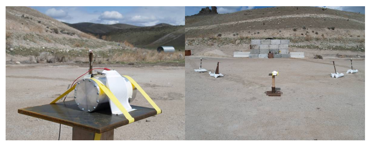
Figure 2. The 3.2-inch Generic Shaped Charge Prepared for Bullet Impact Test

This 3.2-inch generic shaped charge design has some design limitations as an IM test, particularly with the ease that the end closure is dislodged from the main body. Indeed, a 50-caliber bullet impact test of the article with an inert fill will send the end closure to a distance greater than 50 feet. Nevertheless, damage to the test article or witness plate, distance to which fragments are thrown, and blast overpressure can be used to assess the relative IM response of different explosives.