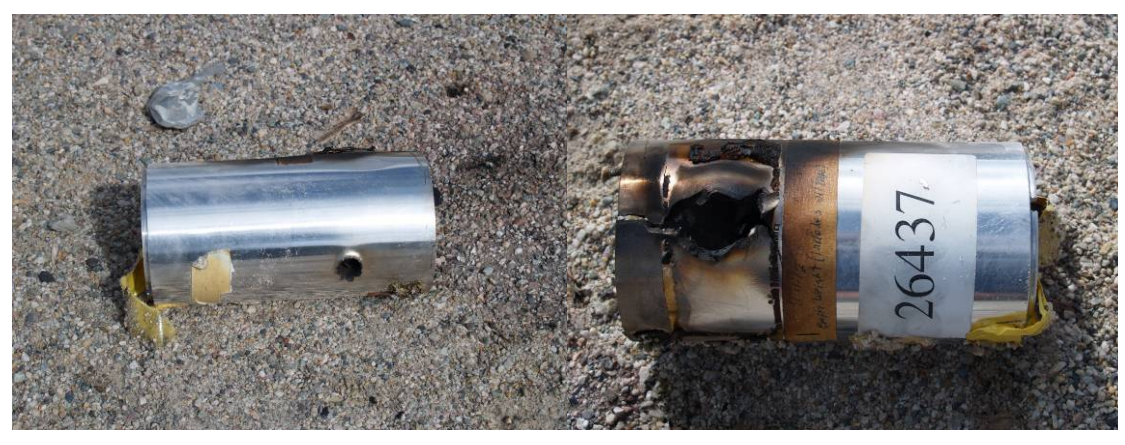
Figure 3. Photographs Showing the Entrance and Exit Holes from the Bullet Impact Test

These results compare favorably with earlier testing using the same 3.2inch generic shaped charge warhead loaded with PBXN-110.<sup>1</sup> In this testing a burn response was reported.